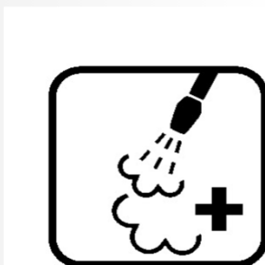
High capacity stainless steel independent steam boiler