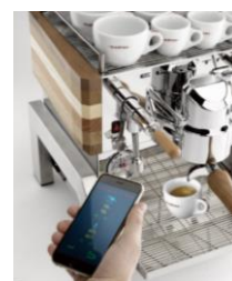
VERVE 1 Group Semi-automatic Stainless Steel/Wood