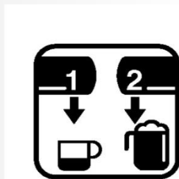
Independent Coffee and Steam Boilers