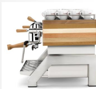
Stainless steel body + wooden side panels